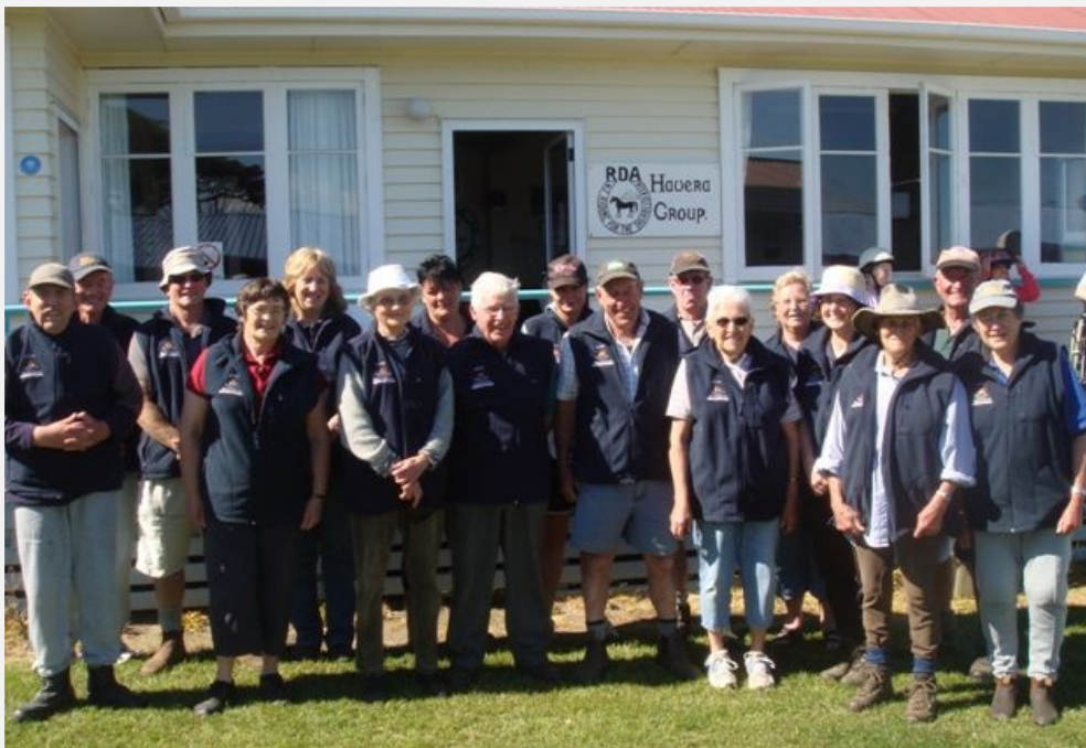
Hawera Group RDA showing off their new group vests that were sponsored by Sandfords Carriers.