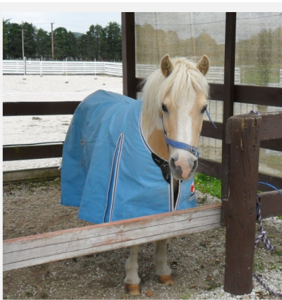
Hokie Pokie wearing his new summer cover.